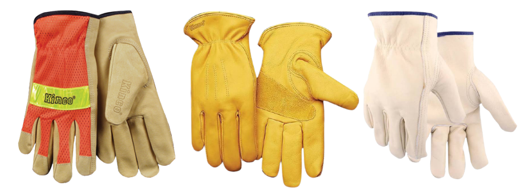
Kinco Pigskin #909

Items shown are subject to availability. Styles and sizes may vary.