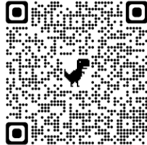
Microsoft Outlook for Android