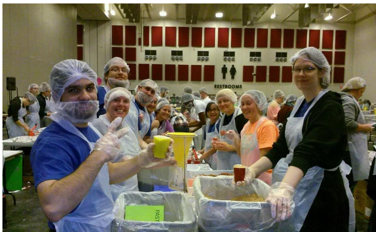
TLC Staff and Faculty working together to package meals at Meals-A-Million

The TLC believes it is important to give back to the community. That is why for the holidays they adopted an OTC family through Crosslines. Faculty, staff, and tutors of the TLC collected food items, money, and gifts for the family of five and delivered them at the end of the semester. Not only that, but the TLC also volunteered at Meals-a-Million. During their time there they packaged 6,480 meals for people who are hungry in the United States and developing countries.